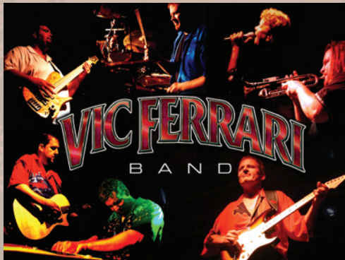
The Vic Ferrari Band no cover charge